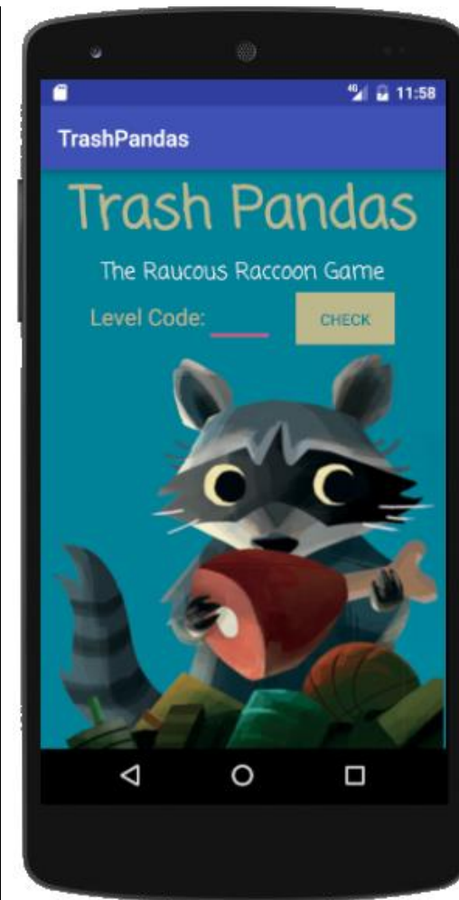
The Drawable Folder